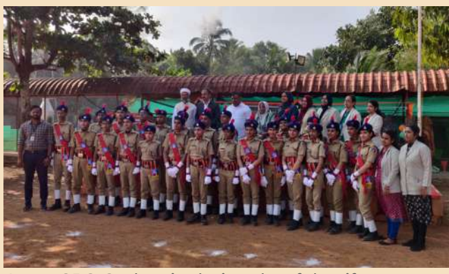
Ansar SPC Cadets in their colourful uniforms

their project at the state level childrens' Maths Congress and UP team secured 3^{rd} place.