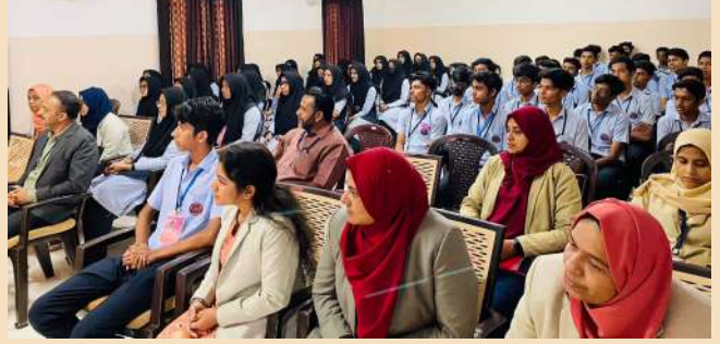
Media Club members attending their club programmes

innovative Different clubs like Happiness club, media club, MC club etc... were initiated in this academic year in addition to the usual literature, arts, maths, science, Keraleeyam and Arabic clubs so as to cater to the interest of our budding talents. Each club worked under the guidance of a patron teacher and organized extensive varieties of programs till the end of academic year. Nature club worked in collaboration with the Mathrubhumi SEED club. Maintenance and setting up of fish pond and project report on the nuisance caused by stray dogs were some of the activities initiated by this club. Malarwadi Teen India club was also active in the campus and organised many programs and won second place in the state level project competition. Two teams among Science club members also participated in the State Level Science Congress and presented the project. Two teams ,one from UP and one from High school got chance to present